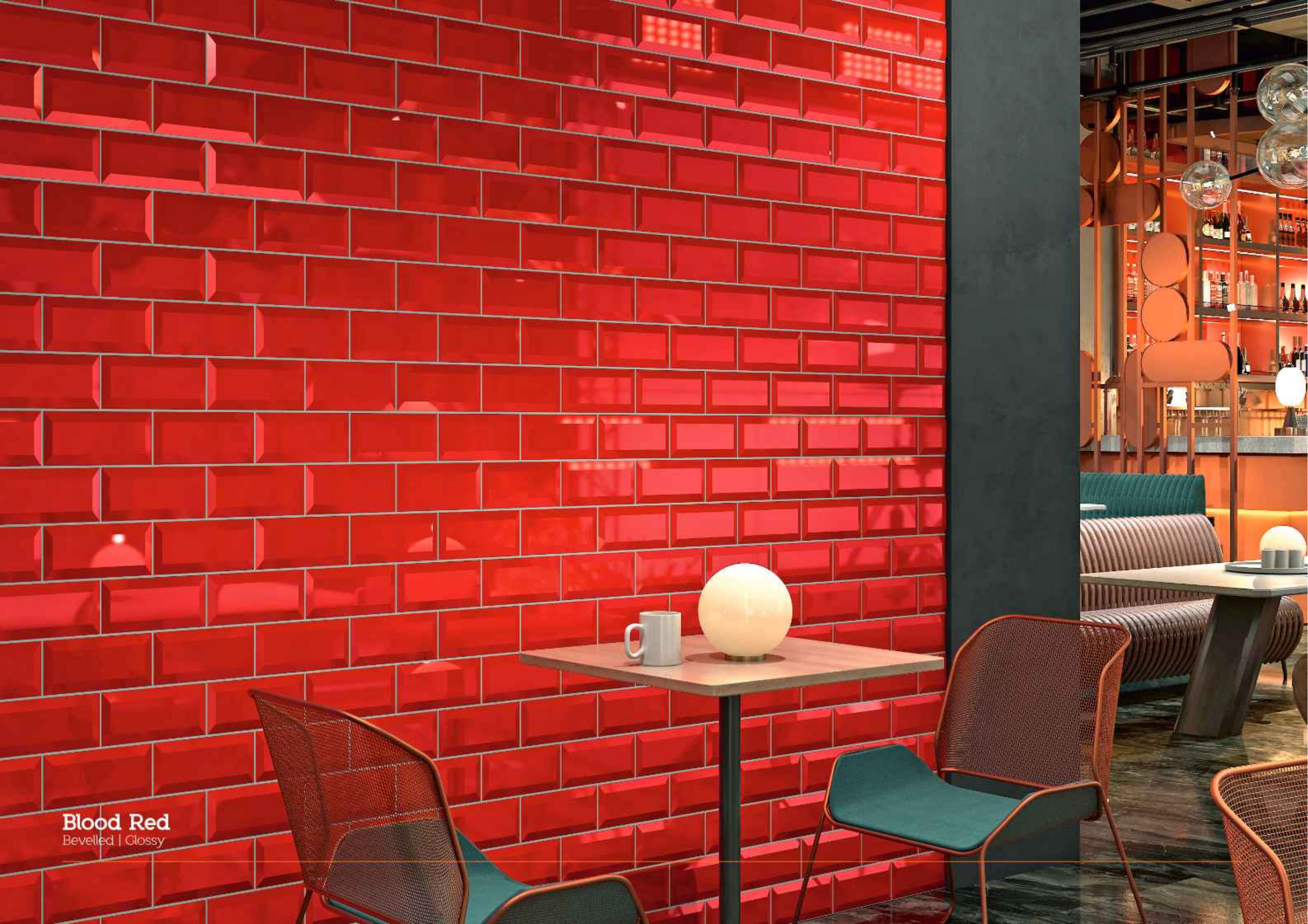
Blood Red Bevelled | Glossy