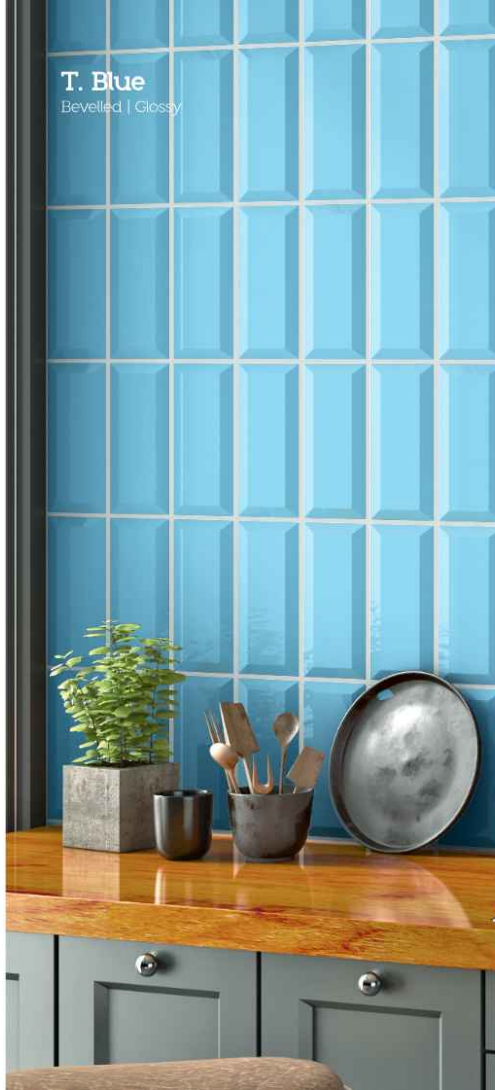
T. Blue Bevelled | Glossy