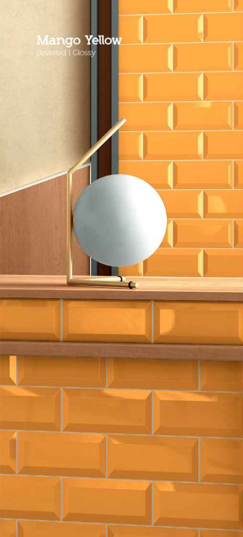
Mango Yellow Bevelled | Glossy