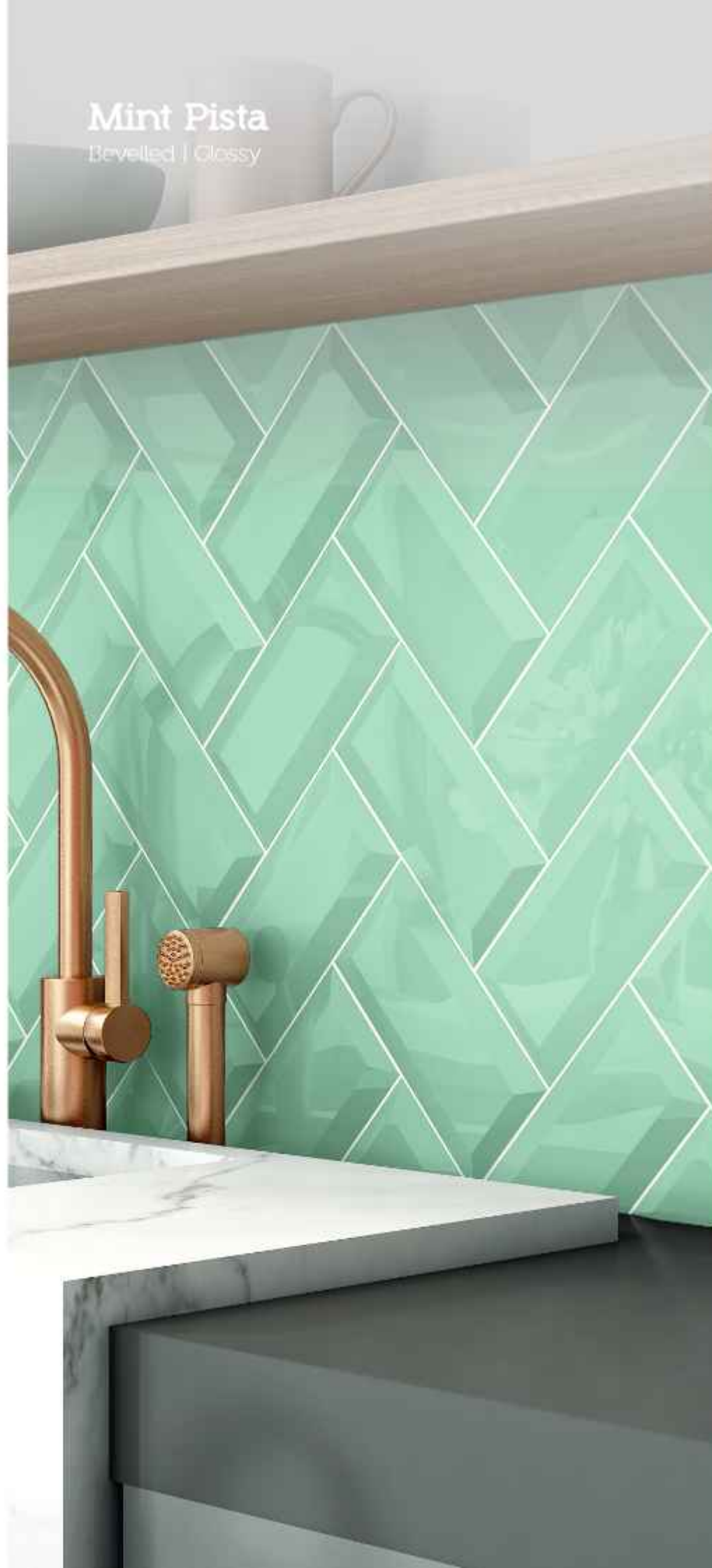
Mint Pista Bevelled | Glossy