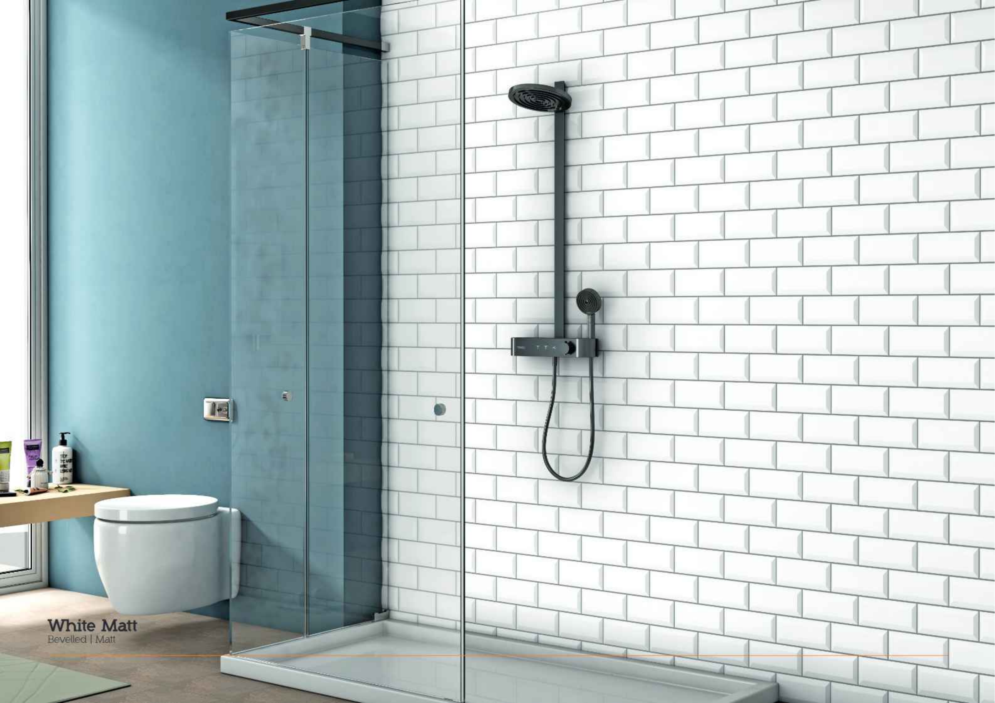
White Matt Bevelled | Matt