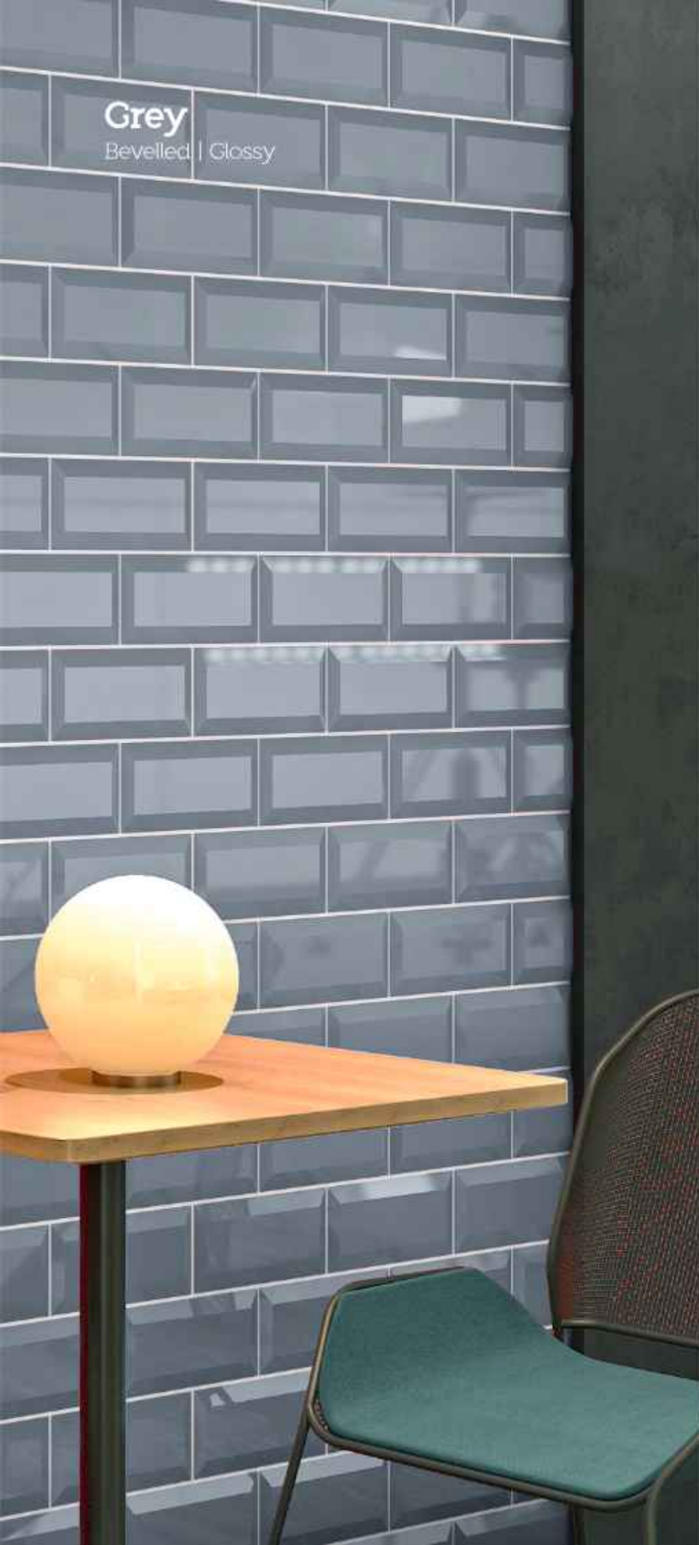
Grey Bevelled | Glossy